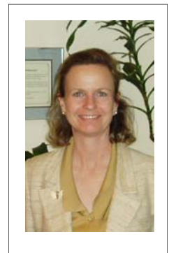
Studying... not gone... studying... so, as we view it... a temporary absence!