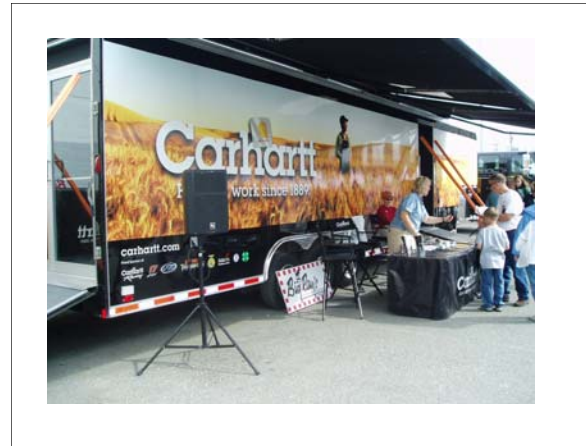
Fairbanks Claim to Fame!

Recording their highest ever number of adult visits from any of the events they have been at in the United States, we can now prove what we already knew—Fairbanksans love Carhartts!